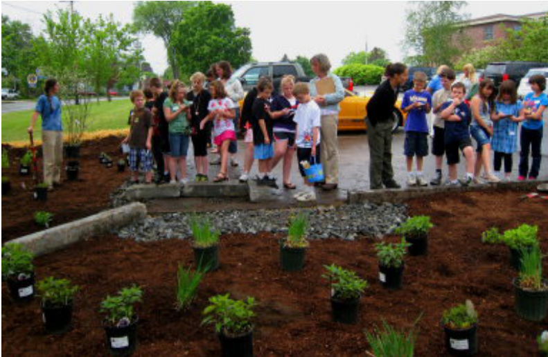
Downtown Rain Garden Project, Keene, NH

Located in downtown Keene, this rain garden project will help protect and restore the water quality of the Ashuelot River Watershed. This project is supported by funds from the sale of the conservation license plate (Moose Plate) through the NH State Conservation Committee grant program. Partners for this project include Antioch University New England and the City of Keene, New Hampshire.