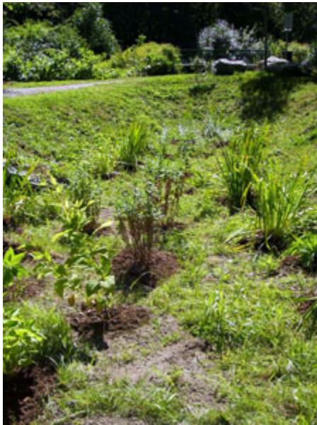
Rain garden along Pine Tree Brook

In Milton, MA, several bioretention cells have been built to catch and filter runoff from adjacent streets. Stormwater has been diverted from pipes into bioretention cells to slow and filter flows, as well as help to cool waters before they enter Pine Tree Brook. The Neponset River Watershed Association, Milton Department of Public Works, and the Pine Tree Brook Neighborhood Association have worked together to establish this project. Costs of the project have been covered with the use of federal funds from the U.S. Environmental Protection Agency provided to the Massachusetts Department of Environmental Protection under an Section 319 grant.