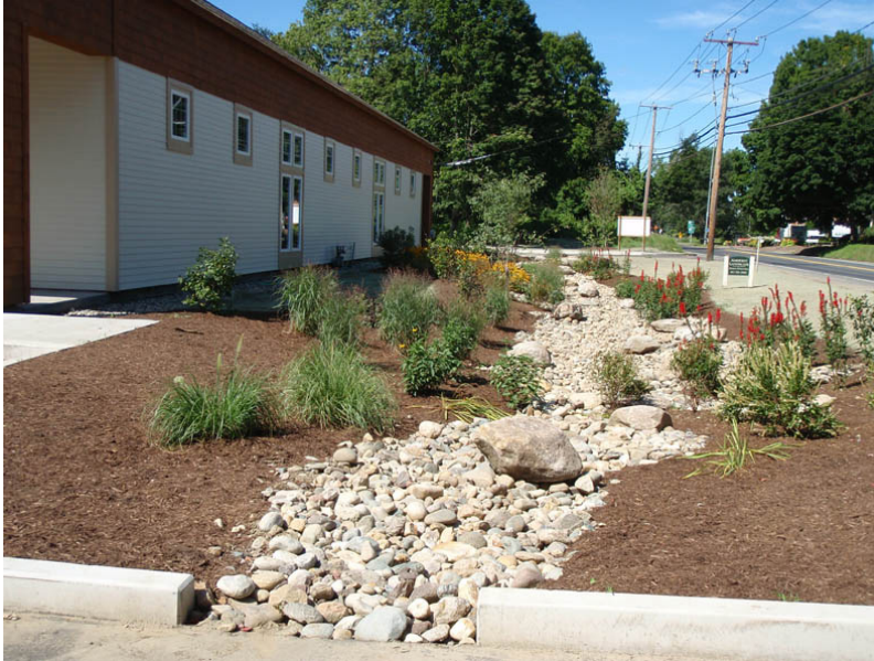
A rain garden along Route 9 in Hadley, captures storm flow from a drive and parking lot. This photo is taken just after installation and before plants are really established.

When a bioretention facility is designed with an underdrain that ultimately delivers flow to surface waters, the capacity of a facility to treat stormwater is critical. Bioretention systems have proven effective at removing many pollutants associated with stormwater: suspended solids, including particulate phosphorous, petroleum hydrocarbons, and heavy metals. The table below shows water quality treatment in the four bioretention facilities tested to date by the University of New Hampshire Stormwater Center.